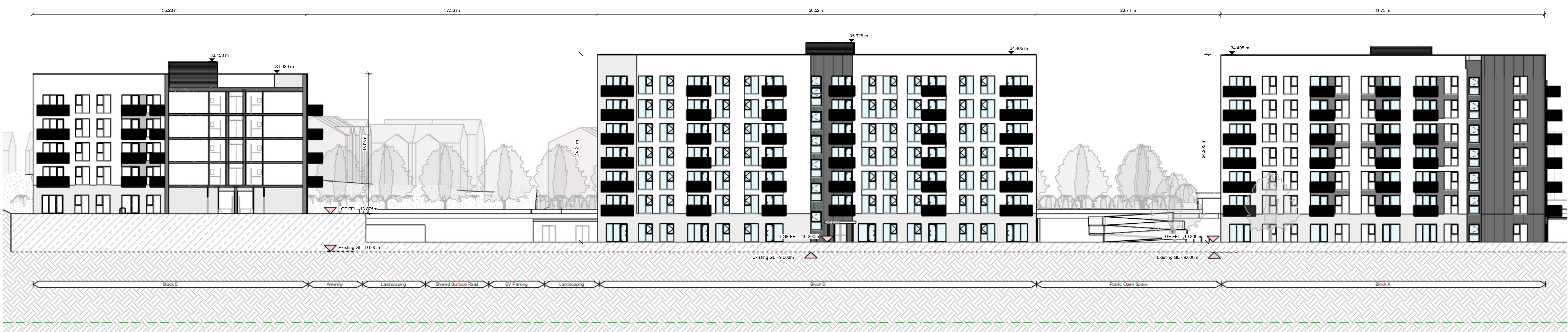
Site Section C-C 1:200

Notes: - Do not scale from this drawing. Use figured dimensions in all cases. - Verify dimensions on site and report any discrepancies to the Architect immediately. - This drawing to be read in conjunction with the Architect's Specification. - © This drawing is copyright and may only be reproduced with the Architect's permission.