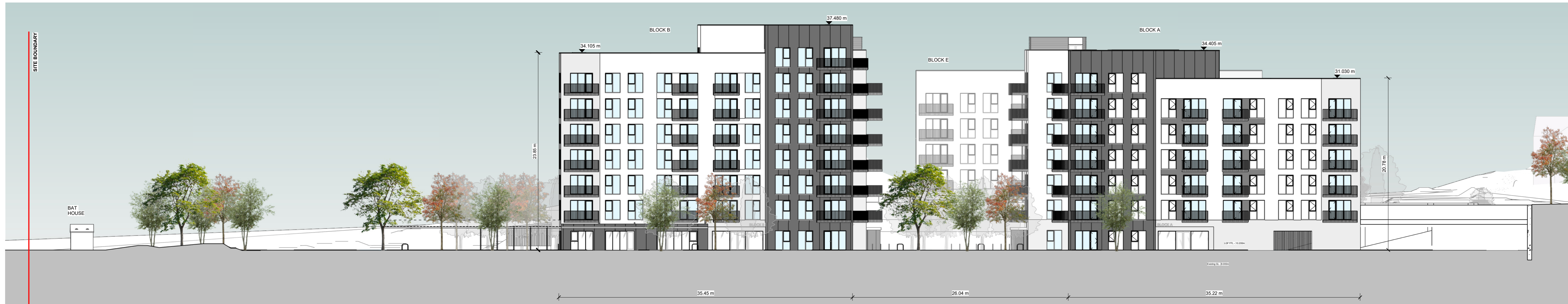
Contiguous Elevation C1 1 : 200