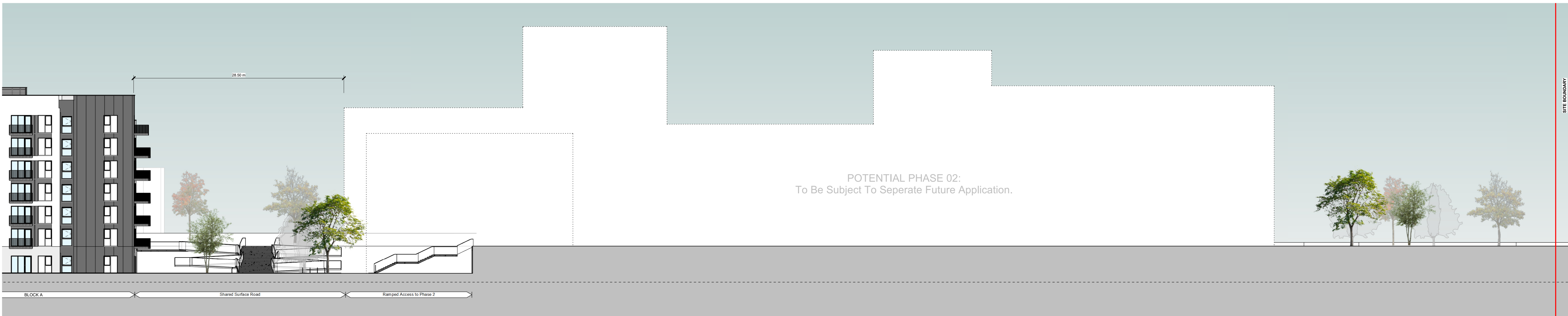
Contiguous Elevation A2 1 : 200

Notes: Do not scale from this drawing. Use figured dimensions in all cases. Verify dimensions on site and report any discrepancies to the Architect immediately. This drawing is to be read in conjunction with the Architect's Specification. It is the drawing is copyright and may only be reproduced with the Architect's permission.