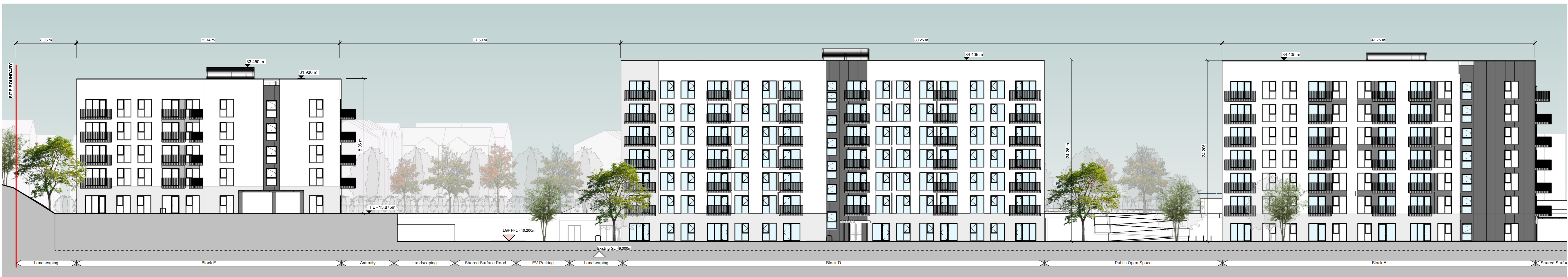
Contiguous Elevation A1 1 : 200