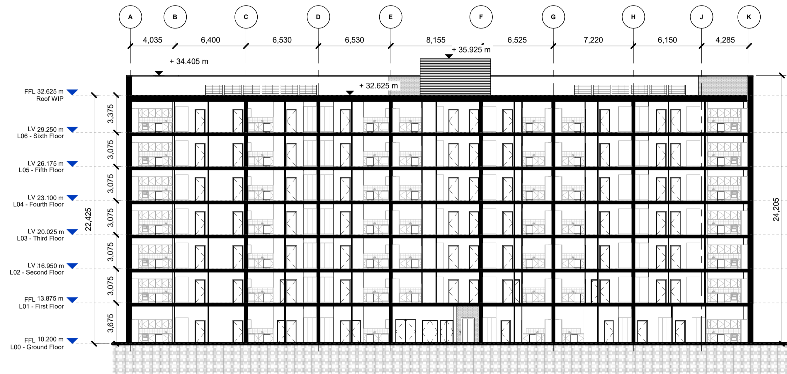
Section 2-2 1 : 200

Notes: - Do not scale from this drawing. Use figured dimensions in all cases. - Verify dimensions on site and report any discrepancies to the Architect immediately. - This drawing is to be read in conjunction with the Architect's Specification. - © This drawing is copyright and may only be reproduced with the Architect's permission.