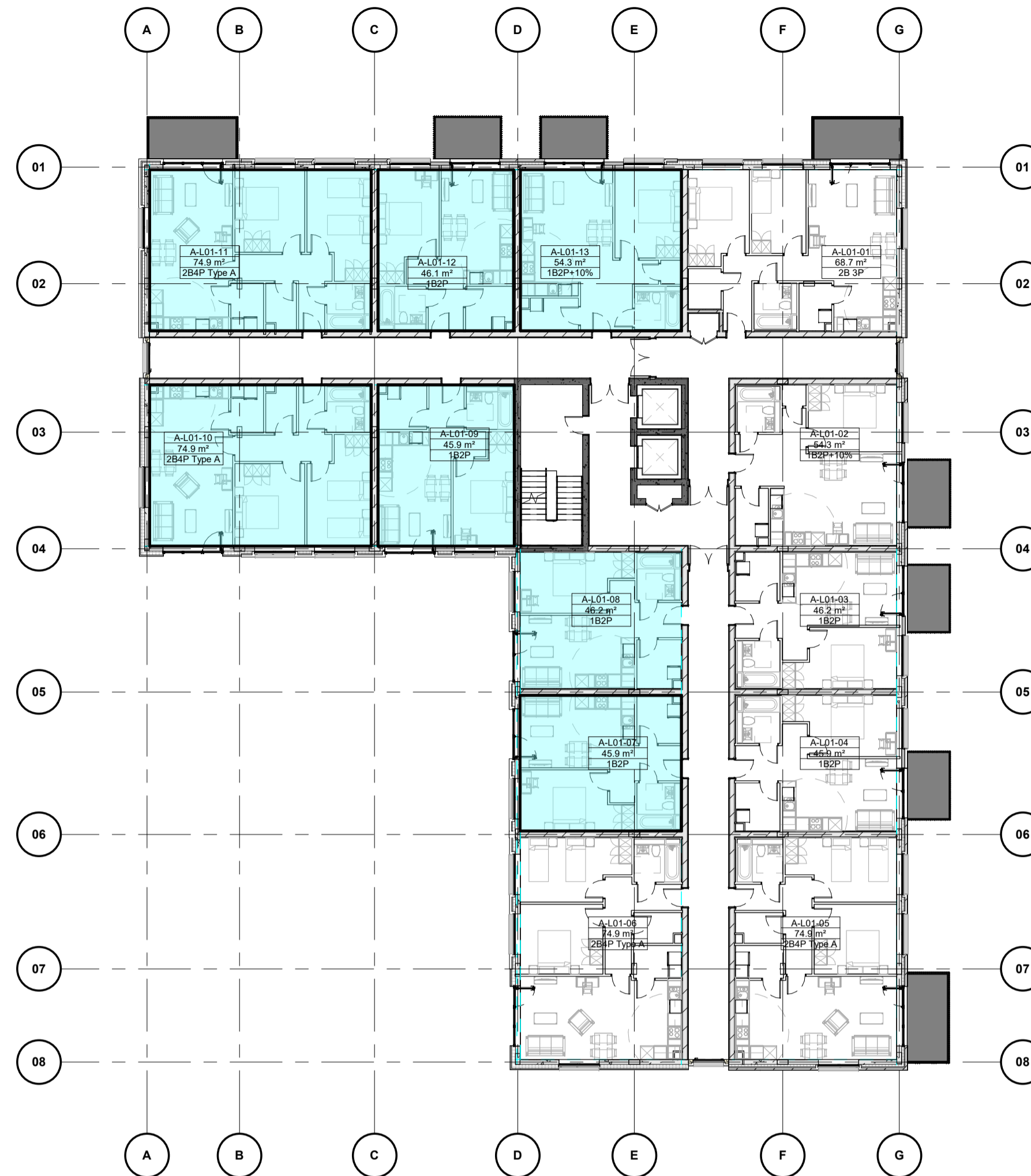
L01 - Upper Ground Floor - Part V 1 : 200