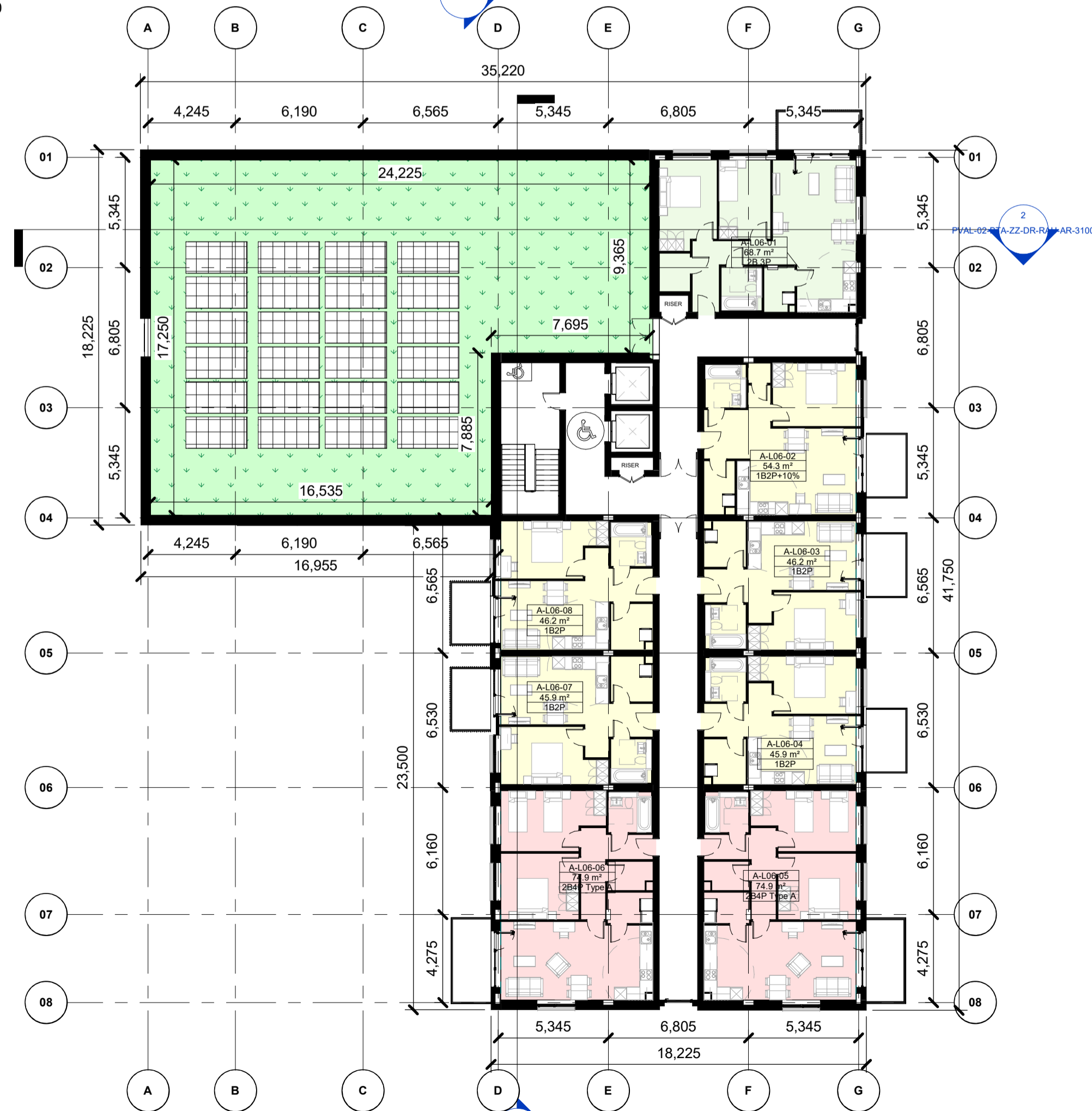
L06 - Sixth Floor 1:200