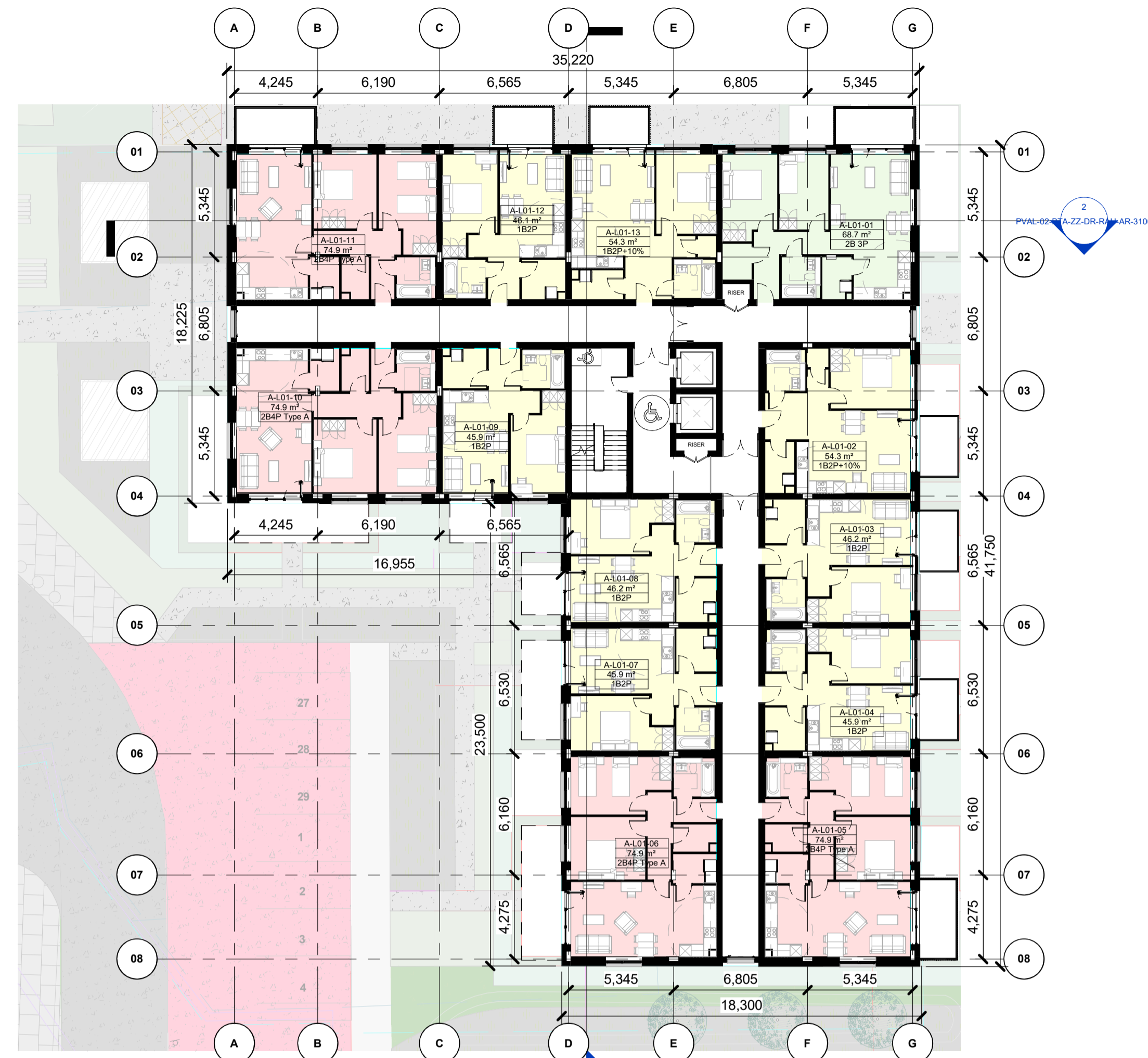
Typical Floor Plan_First Floor - Fifth Floor 1:200