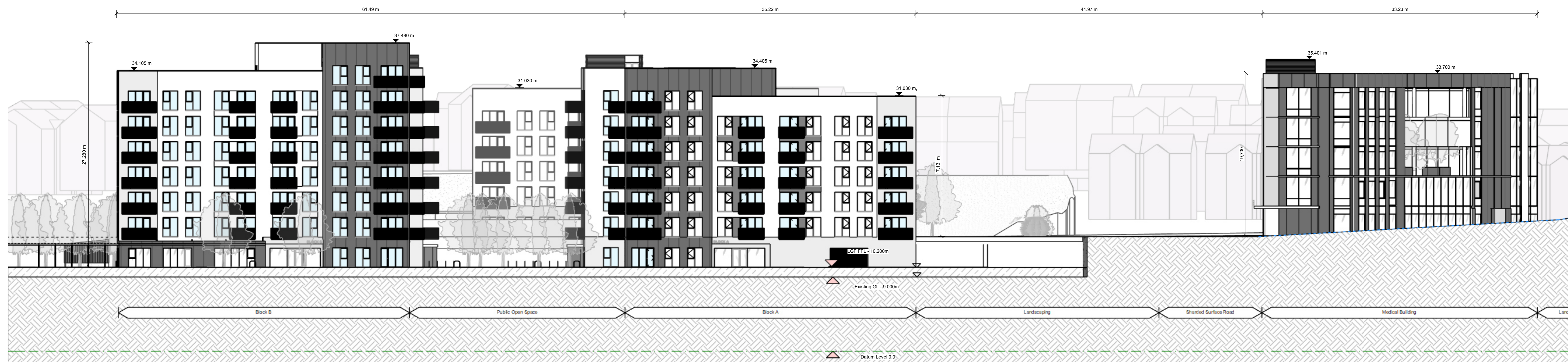
Sectional Elevation A-A - Zone 01 1:200