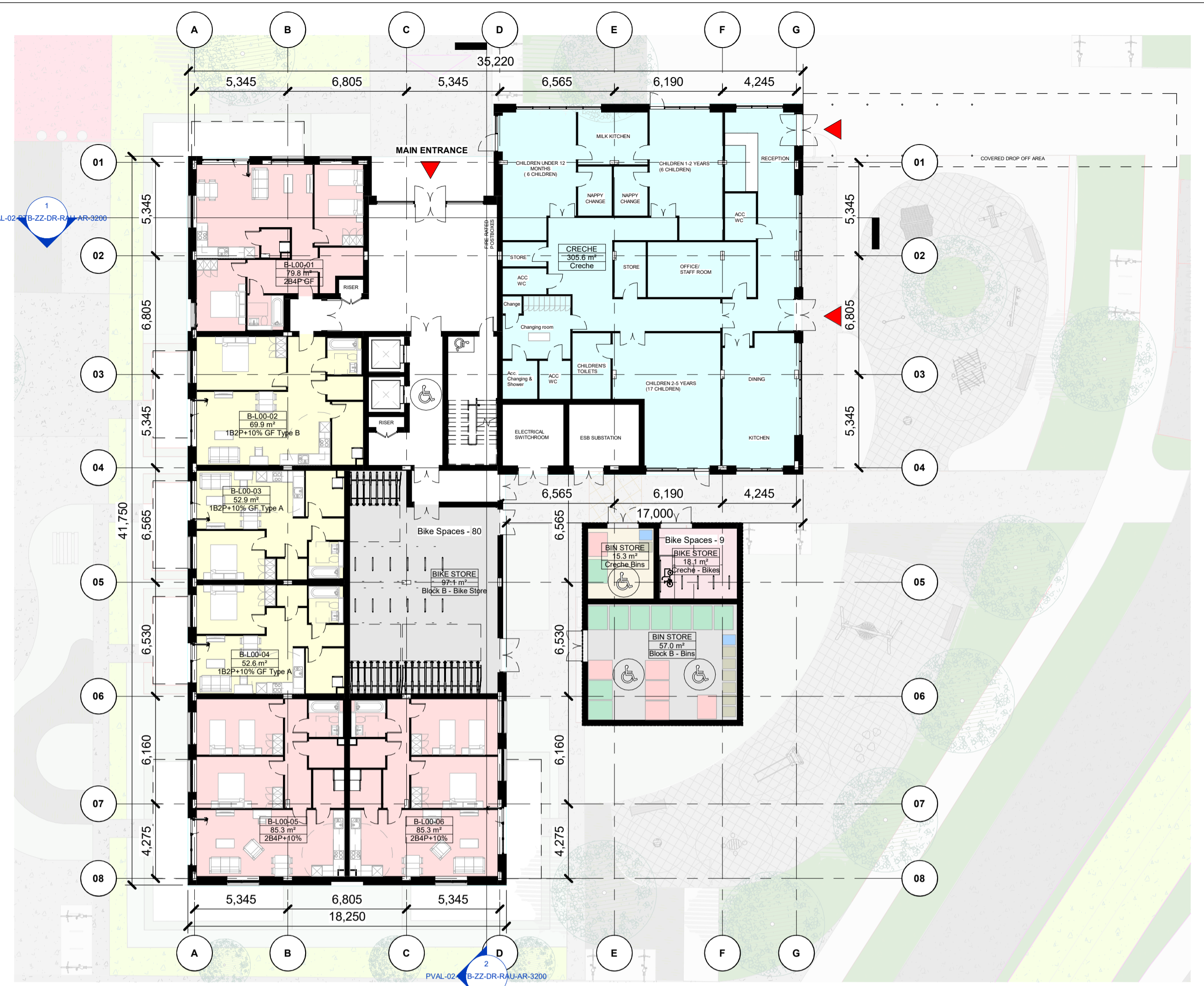
L00 - Ground Floor Plan 1:200