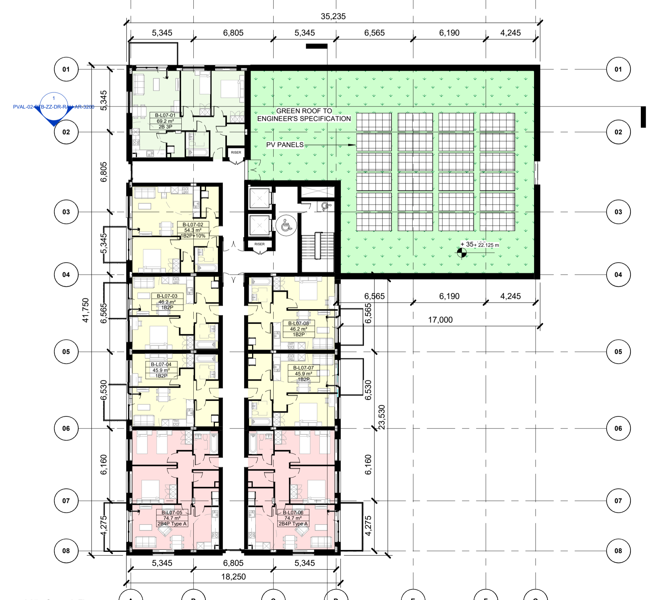
L07 - Seventh Floor 1:200