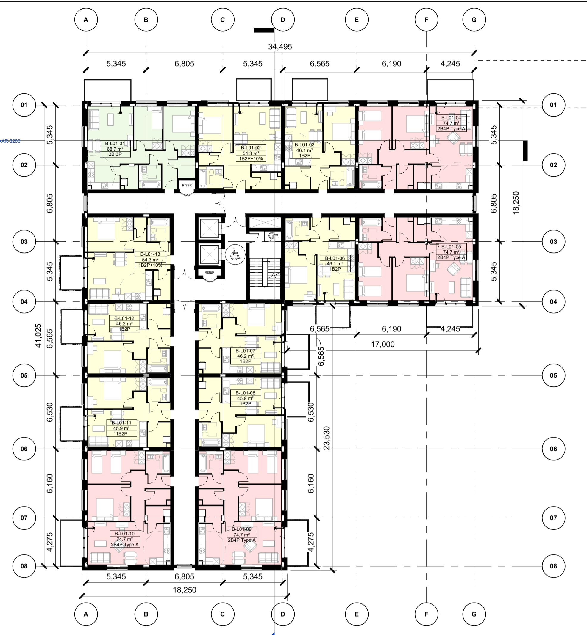
Typical Floor Plan_First Floor - Sixth Floor 1:200