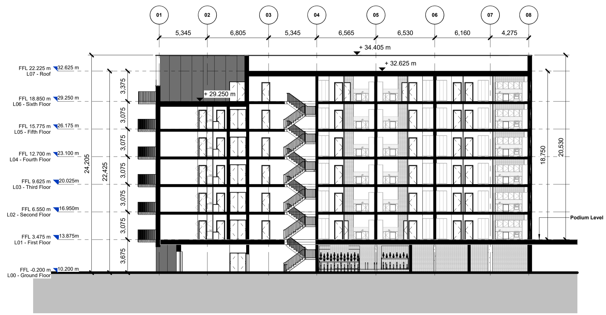
Section 1-1 1 : 200