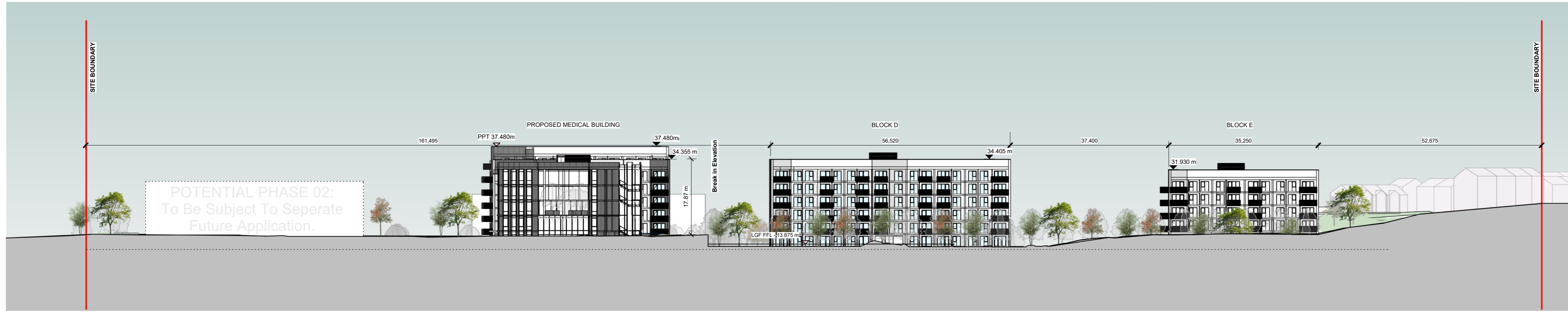
Contiguous Elevation B 1:500