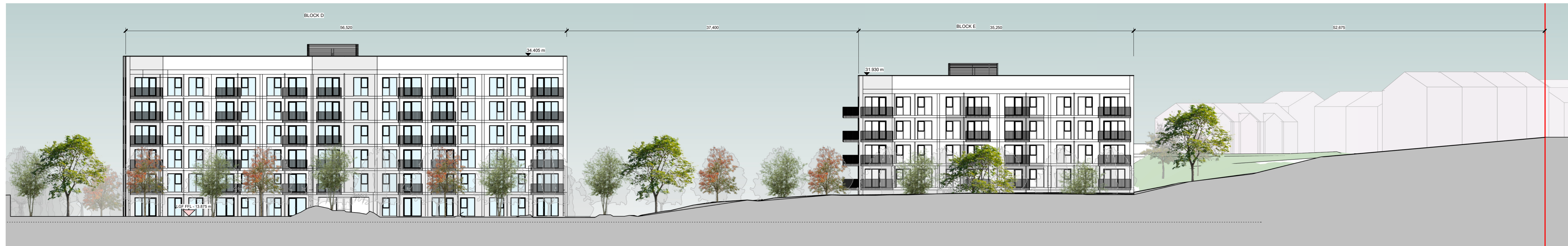
Contiguous Elevation B2 1:200

Notes: Do not scale from this drawing. Use figured dimensions in all cases. Verify dimensions on site and report any discrepancies to the Architect immediately. This drawing is to be read in conjunction with the Architect's Specification. © This drawing is copyright and may only be reproduced with the Architect's permission.