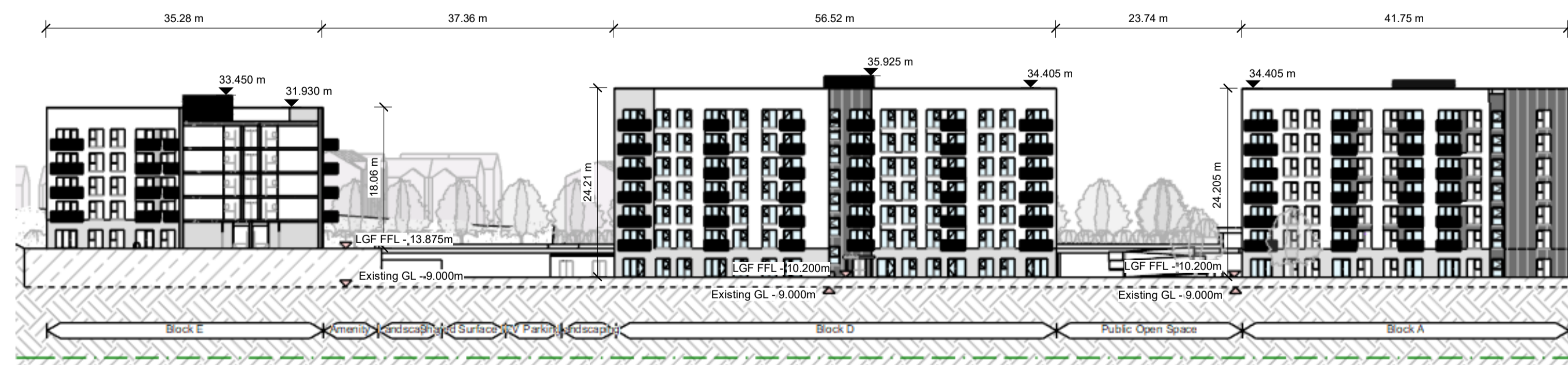
Site Section C-C 1 : 500

Notes: - Do not scale from this drawing. Use figured dimensions in all cases. - Verify dimensions on site and report any discrepancies to the Architect immediately. - This drawing is to be read in conjunction with the Architect's Specification. - © This drawing is copyright and may only be reproduced with the Architect's permission.